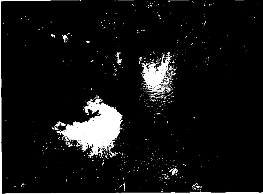
Figure 4. An ephemeral stream with high concentrations of dissolved organic N runs over permafrost near Delta Junction, Alaska. The dark color of the water is caused by dissolved organic compounds produced during the movement of water through organic-rich surface horizons. The movement of DON in streams such as this one represents a potentially significant loss of N from terrestrial ecosystems.

ronments where decomposition is slow. Plant uptake of organic N is an active area of research, and more work is needed to evaluate the relative importance of plant organic N use across ecosystems. There are also important questions about the role of mycorrhizal associations in the process (including the potential for uptake of more complex forms of DON) and persistent difficulties in quantifying the benefits to individual plants of organic N uptake. However, the process of organic N uptake does appear to have important implications for plant–microbe competition, and is likely to act, at least for some ecosystems, as a short circuit in the N cycle.