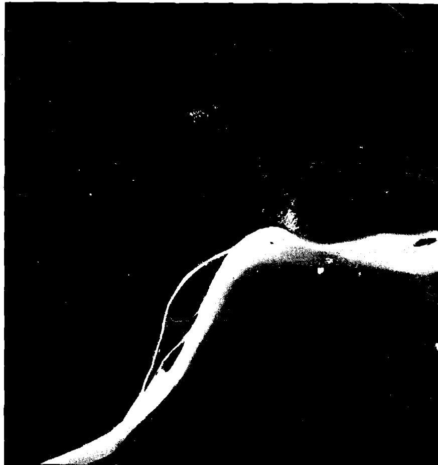
Figure 2. The confluence of the silt-laden Amazon and organic-rich Manacapuru rivers just west of Manaus, Brazil. Image taken with the Earth Observing-1 Advanced Land Imager. The dark color of the Manacapuru results from the high concentrations of dissolved organic matter in the water.

An N leak is fundamentally different from an N loss that can be controlled by biological demand. Leaks occur where biotic systems cannot fully prevent N losses, despite an overall system demand for N. Over time, nutrient leaks need to be replaced by new N, or they will constrain the accumulation of N capital (the sum of N in plants and soils) in an ecosystem. Eventually, such processes can contribute to N limitation of productivity. The hypothesis that DON may function as a leak of N from ecosystems was first developed by Hedin et al. (1995), and based on observations that DON fluxes dominate stream N fluxes in Chilean ecosystems characterized by very low atmospheric inputs of N and high rates of precipitation. Multiple studies have now shown that DON can account for a significant fraction of N losses to streams, despite ecosystem demand for N (Sollins and McCorrison 1981; Hedin et al. 1995; Lajtha et al. 1995; Perakis and Hedin 2002). DON losses are sometimes described as biologically